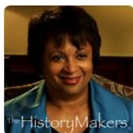
Librarian of Congress Visits AAHM PAGE 3