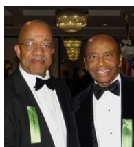
GALA: Early African American Pioneers PAGE 1